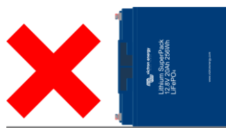
12,8/20 (BAT512020705) (4)