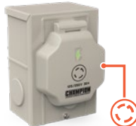
POWER INLET BOX