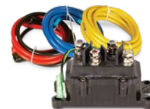
Cables & Contactor

Champion Power Equipment, Inc. 12039 Smith Ave • Santa Fe Springs, CA 90670 • USA 1-877-338-0999 • www.championpowerequipment.com MADE IN CHINA / HECHO EN CHINA / FABRIQUÉ EN CHINE